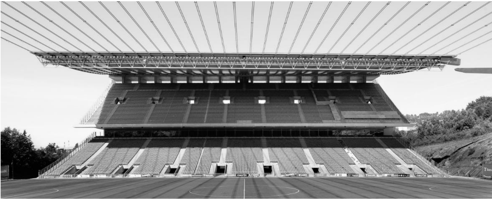
ESTADIO BRAGA, EDUARDO SOUTO DE MOURA, PORTUGAL, 2003