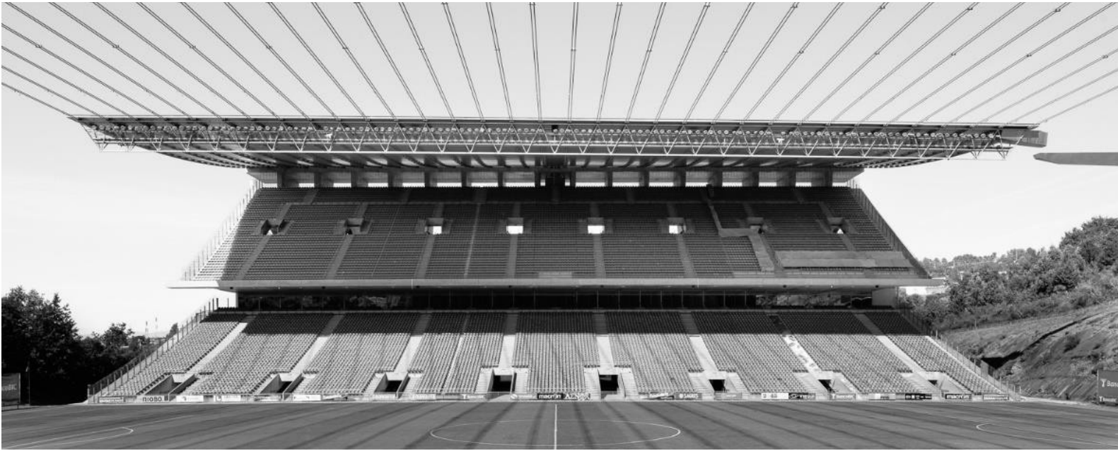
ESTADIO BRAGA, EDUARDO SOUTO DE MOURA, PORTUGAL, 2003